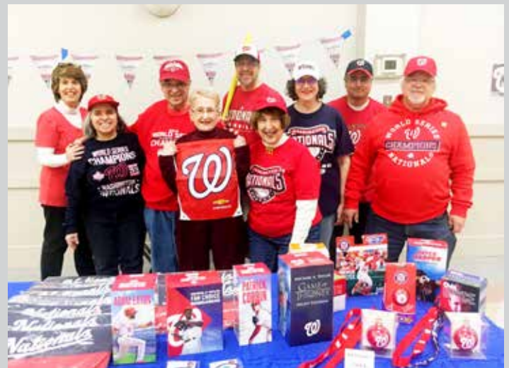
Congregants displayed their loyalty to their favorite professional baseball team during a program in the social hall on Dec. 25.