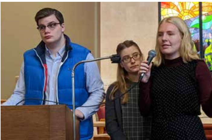
Three German teens involved in the Action Reconciliation for Peace program spoke in the TI sanctuary.