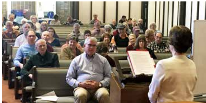
A quorum of congregants approved updates in January to the rules that govern the affairs of Tikvat Israel.

About 60 members of Tikvat Israel – well beyond the needed quorum – ratified a streamlined set of rules governing how TI should operate, during a congregational meeting on Sun., Jan. 12.