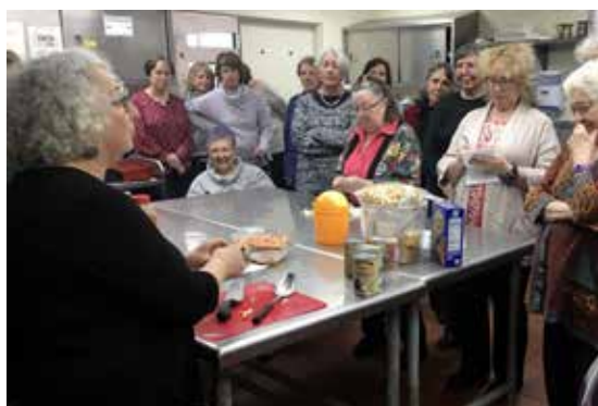
Women's Network members crowded around the kitchen table at TI for the Beyond Chicken Soup program in January.

Join the Women's Network and its Beyond Chicken Soup conversation by submitting a favorite soup recipe and/or cooking tip to Paula Kasper (pkinc04@yahoo.com). Kasper will compile the recipes and share with those who are interested.