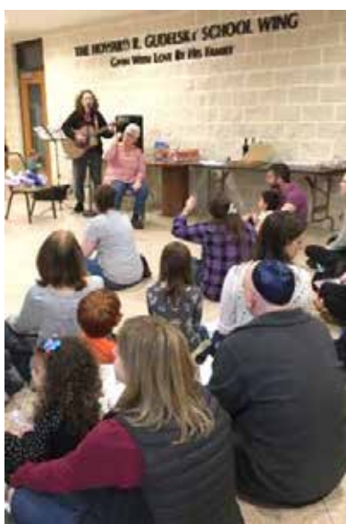
Activity during the ECC’s PJ Havdalah event that took place in January at Tikvat Israel.

The ECC has begun registration for the 2020-21 school year. With our Hebrew immersion program, excellent staff and flexible hours, the ECC is the place for students 14 months of age through pre-kindergarten. If you know someone interested in the school, they are welcome to set up a tour at a convenient time. Application information is available on the Tikvat Israel website.